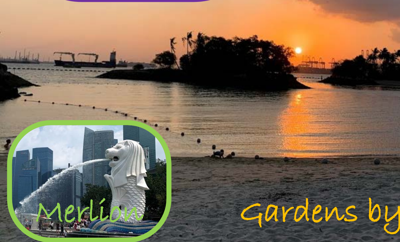
Gardens by the bay