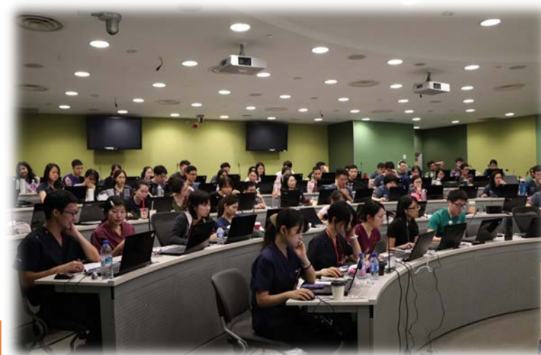
Computer Based Simulation