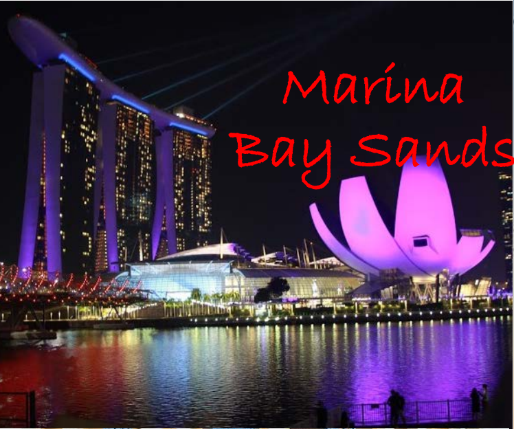
Marina Bay Sands