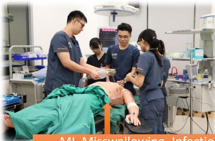
MI, Misswallowing, Infection, Thyroid crisis, Multiple injury...etc