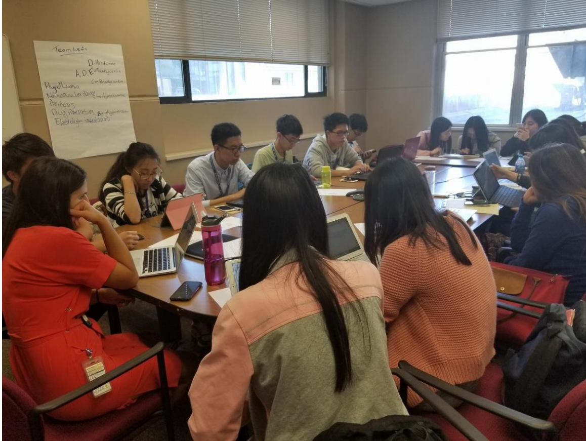
↑ group work time in the afternoon