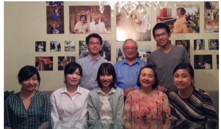
*House owner and medical students from Taiwan.